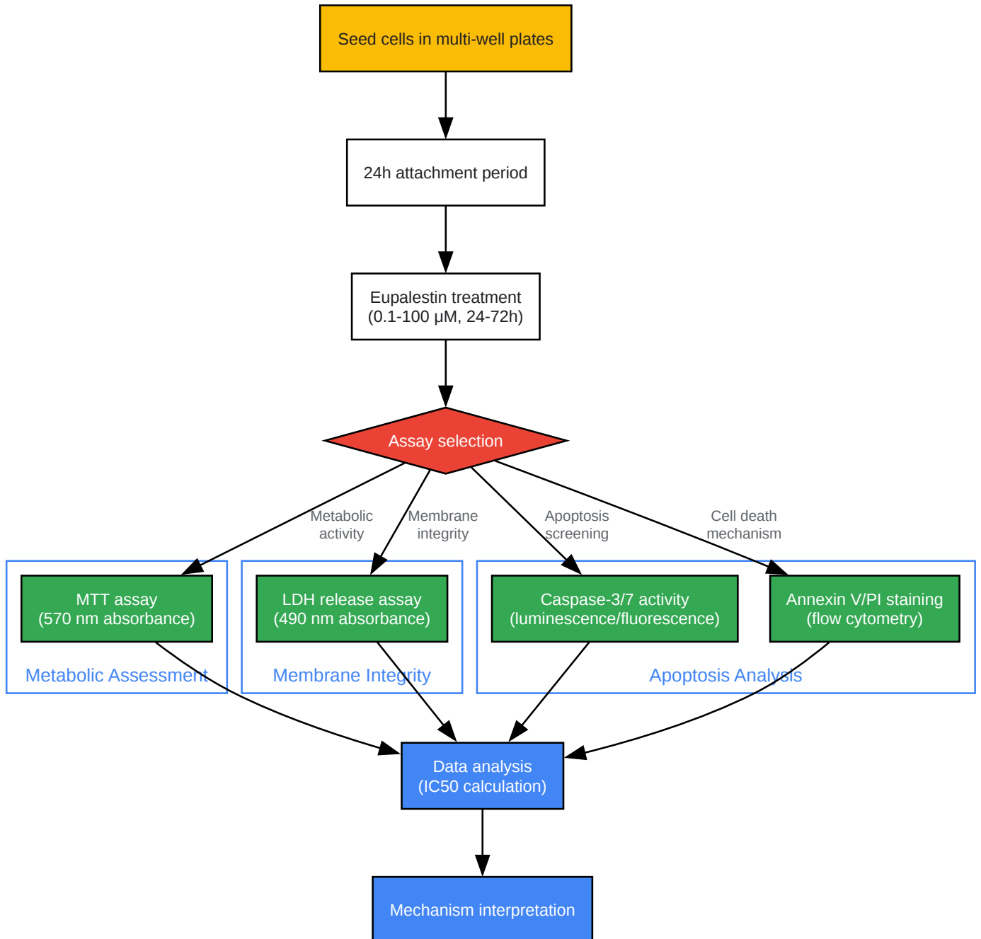
Eupalestin Cytotoxicity Assessment Workflow

Click to download full resolution via product page