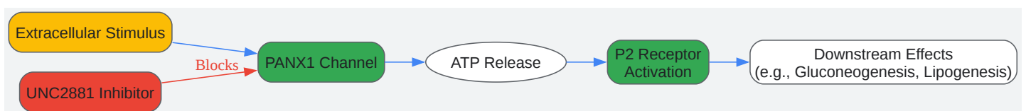
Diagram 2: PANX1-Mediated ATP Release Signaling Pathway

Click to download full resolution via product page