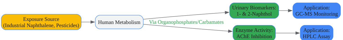
Figure 2: HPLC Workflow for AChE Activity Estimation

Click to download full resolution via product page