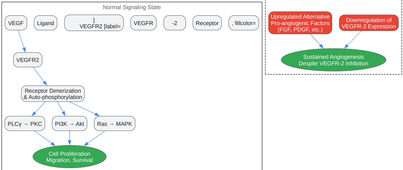
VEGFR-2 Signaling in Normal vs Resistant States

Click to download full resolution via product page